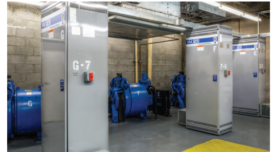
These energy-efficient elevator controllers installed in Marquis II improve service reliability for occupants.