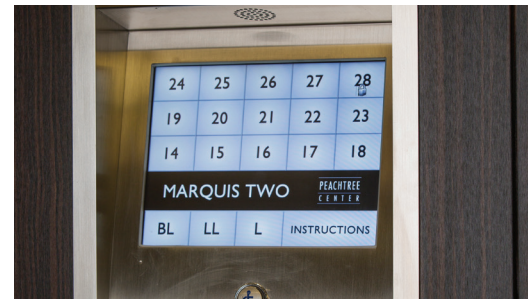
New kiosks improve elevator efficiency and reduce wait times by grouping riders based on the floors selected.

Georgia Power's Commercial Energy Efficiency Program makes incorporating energy-efficient improvements into your business even more attractive.