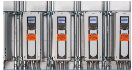
New VFDs give operators greater control over the cooling towers, condenser water pumps and exhaust fans in the North and South Towers.