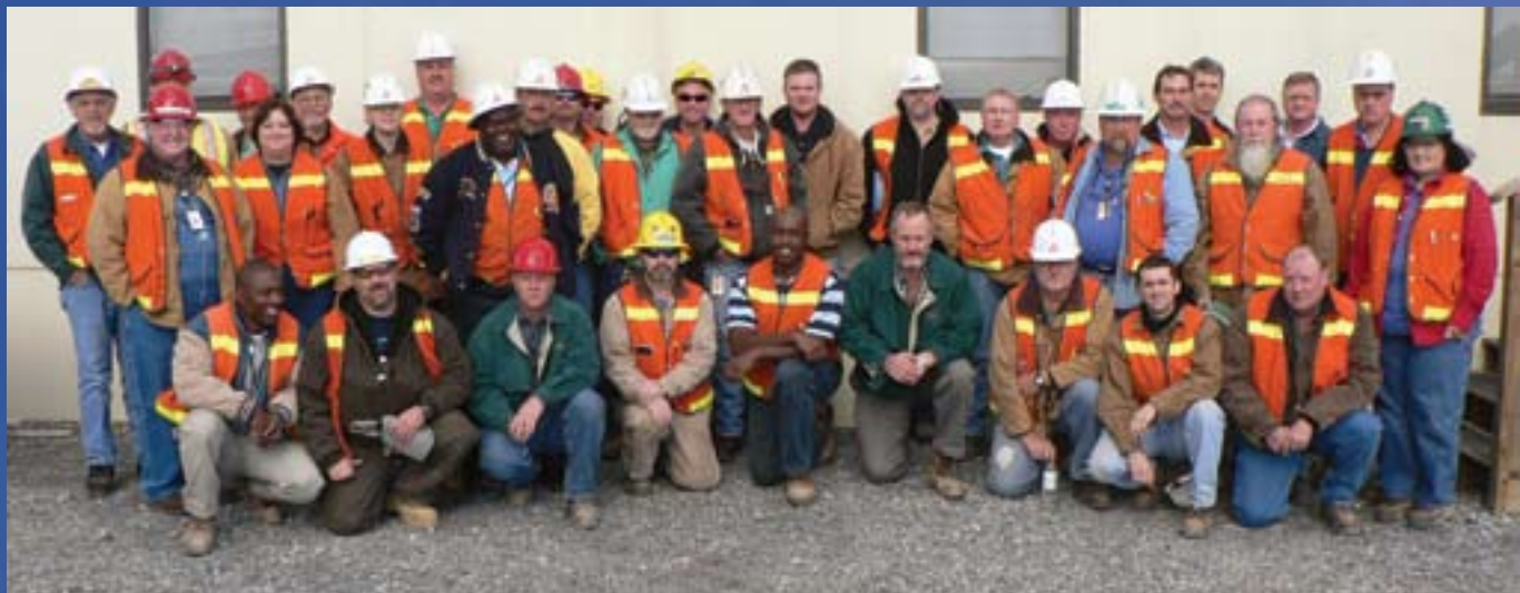
The Bowen Flue Gas Desulfurization (FGD) team worked long, hard hours on four new scrubbers that will remove 95 percent of sulfur dioxide from plant emissions.