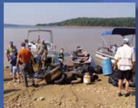
Bowen employees participate in the annual Great Allatoona Lake Clean Up.