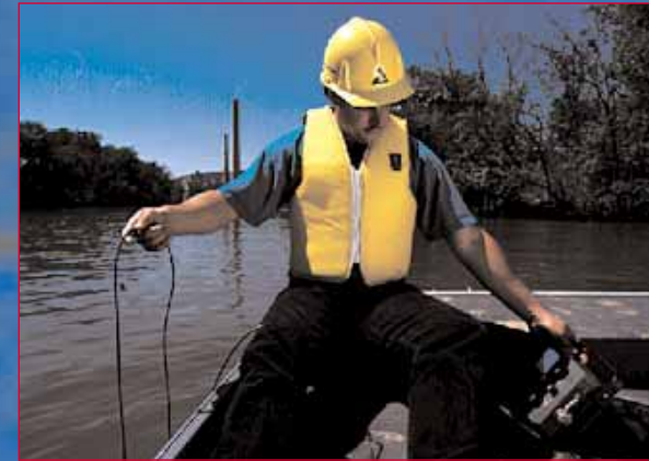
The plant's environmental specialist and lab personnel continuously monitor the Coosa River water to ensure that the surrounding environment is properly maintained.

The environmental excellence program helps create the highest possible level of awareness among all employees. They take pride in seeing that their plant attains or exceeds all environmental regulations, helping to solidify the company's position as an environmental leader.