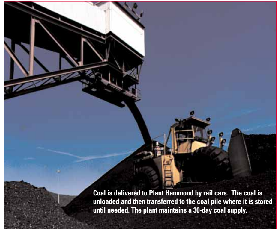
Coal is delivered to Plant Hammond by rail cars. The coal is unloaded and then transferred to the coal pile where it is stored until needed. The plant maintains a 30-day coal supply.

As electricity is generated at Plant Hammond, it is conducted to a power transformer in an adjacent substation, which increases the voltage. The high-voltage electricity is then fed into transmission lines for distribution throughout the state.