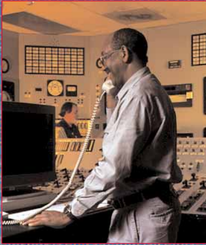
The control room is the center for plant operations. Here the operators control the unit's turbines and generators as well as other plant equipment.