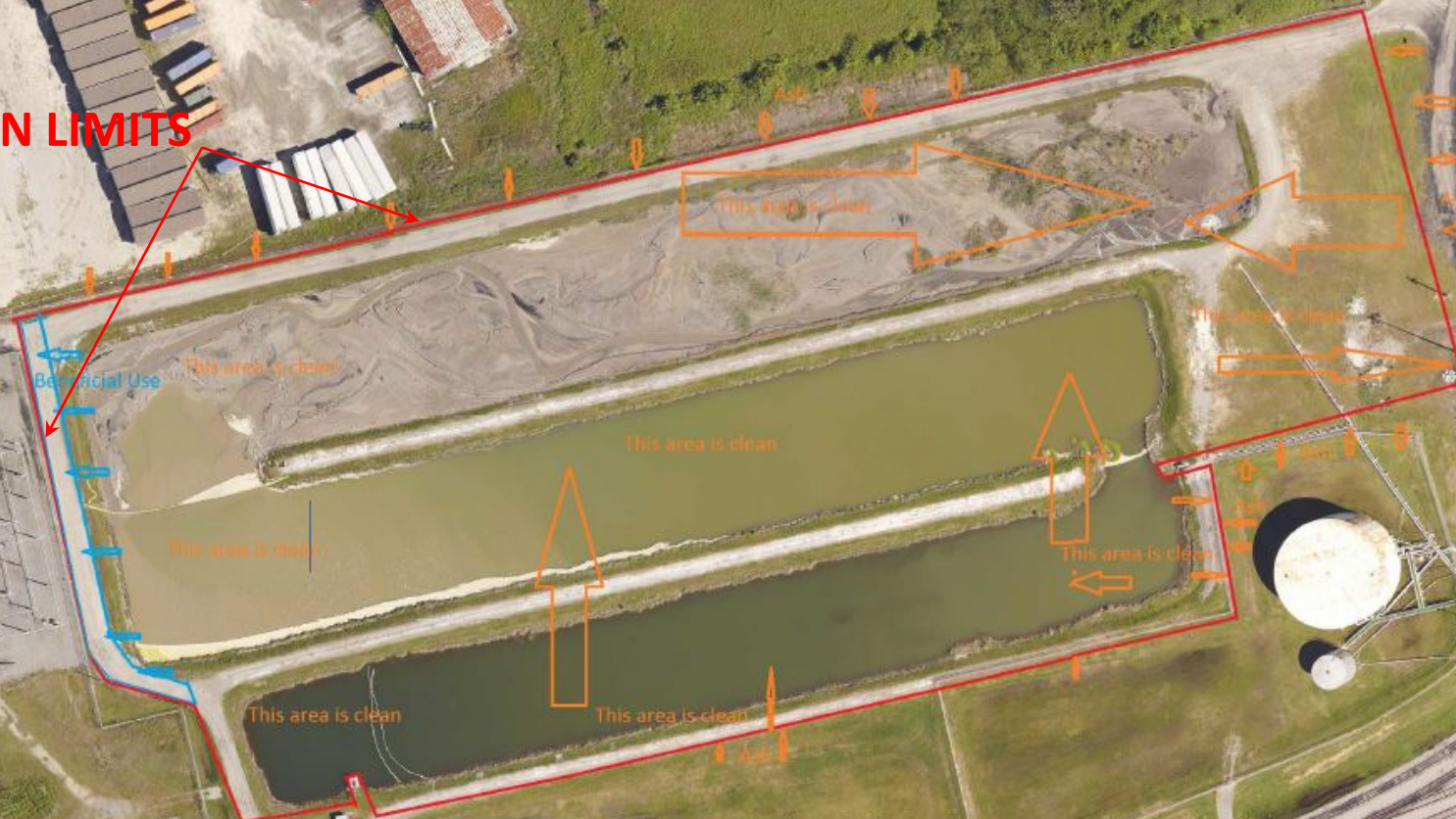
FIGURE 3 - PLANT KRAFT AP-1 EXCAVATION LIMITS